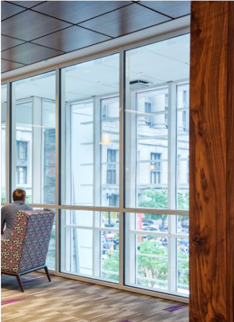
Fireframes® Curtainwall Series Fire-rated Frames

This EPD was created using a UL-verified EPD generator for Allegion's full product portfolio. For additional product specific EPDs, please contact Allegion at Tim.Weller@allegion.com .