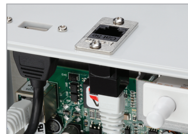
PIM400-1501-LC has RJ-45 and USB external connectors to make installation easy.

Allegion, the Allegion logo, Schlage, and the Schlage logo are trademarks of Allegion plc, its subsidiaries and/or affiliates in the United States and other countries. All other trademarks are the property of their respective owners.