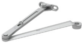
4040XP Arm (Universal)