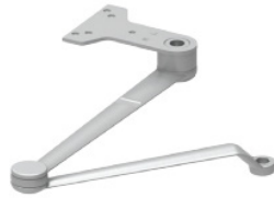
4111 Arm (Application-specific)